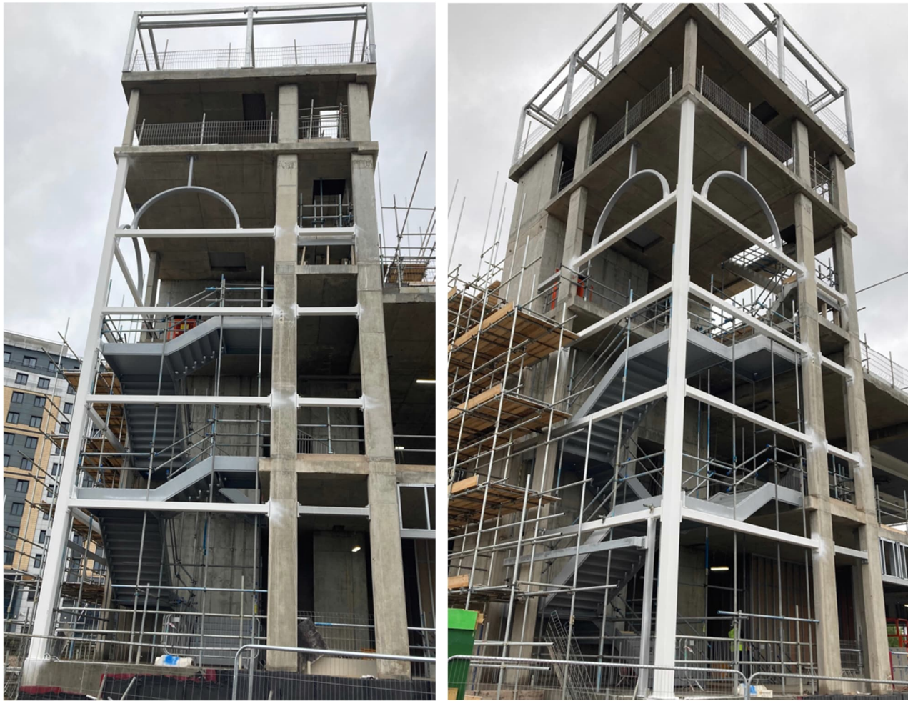
The Island Quarter, Phase 1A, Nottingham